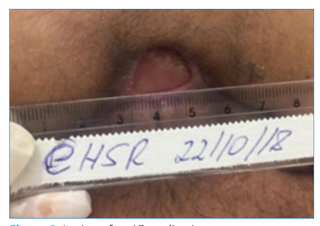
Figure 3. Lesion after 15 applications.

In the graphic below (Fig. 4), the values of the PUSH scale used to measure the area in square centimeters, the quantity of exudate and type of tissue present in the lesion, are represented.