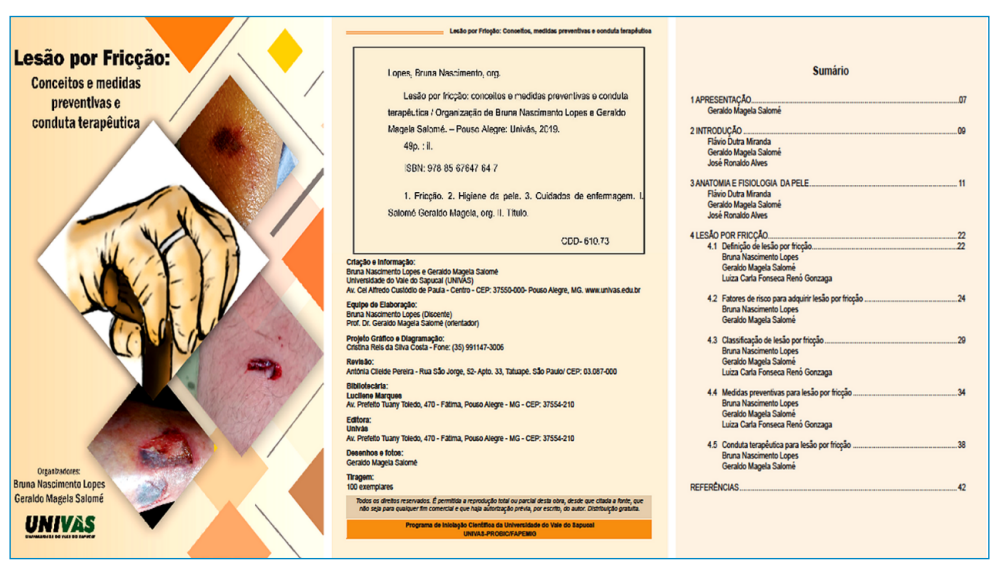
Figure 2. Cover, catalog and summary of the booklet Friction Injury: concepts, preventive measures and therapeutic conduct. Pouso Alegre (MG), Brasil – 2020.