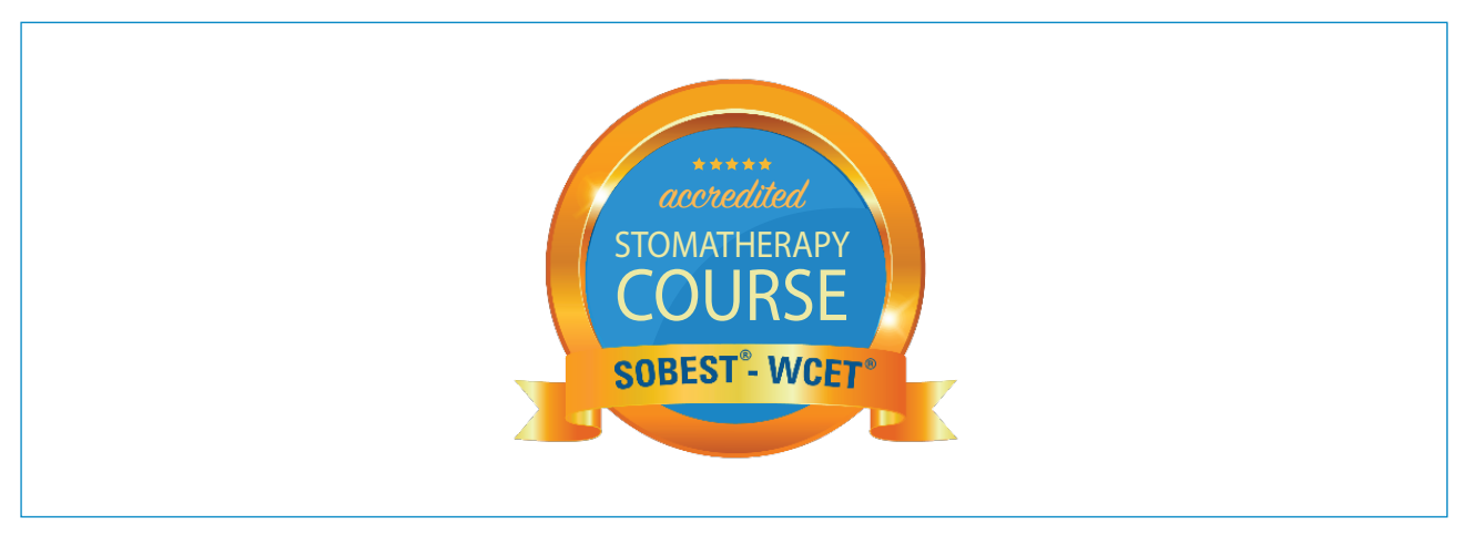
Figure 2. Quality seal assigned to courses accredited by Sobest®.

Considering the trajectory of enterostomal therapy and postgraduate courses in enterostomal therapy in Brazil, Sobest® launched the concept of "accredited enterostomal therapy courses" (Fig. 2). Accreditation is a legally secure concept to define the role of the association in relation to the courses that pursue such quality certification. According to the Portuguese language dictionary, accreditation is the official recognition of a person or entity for the performance or accomplishment of something. In this process, Sobest® therefore recognizes an entity (course) for the performance (training) of something (enterostomal therapy). Sobest® "believes" or "gives credit" to any postgraduate course in enterostomal therapy nursing that voluntarily pursues such certification. Accreditation implies that the course meets all the essential criteria and requirements for the training of the enterostomal therapists according to WCET<sup>TM</sup> guidelines and Sobest® itself.