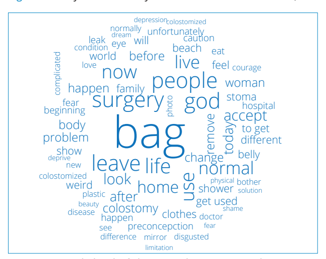
Figure 2. Word cloud of the textual corpus. Fortaleza, Ceara, Brazil, 2017.

non-use as an attempt to resume 'normality' and perfection of your body. This can be perceived through the lines: